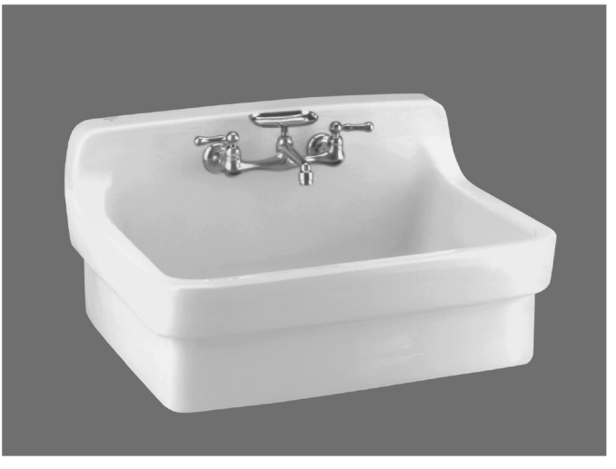
Shown with 7295.152 Heritage faucet with soap dish and lever handles (not included)